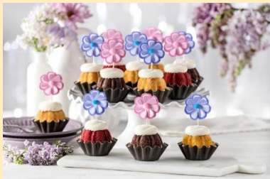
Mother's Day Bundtins